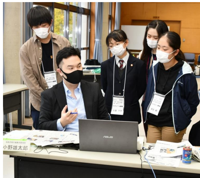
▲Children getting layout advice from an experienced journalist. They worked on the layout, thinking about how to make it easier to read.