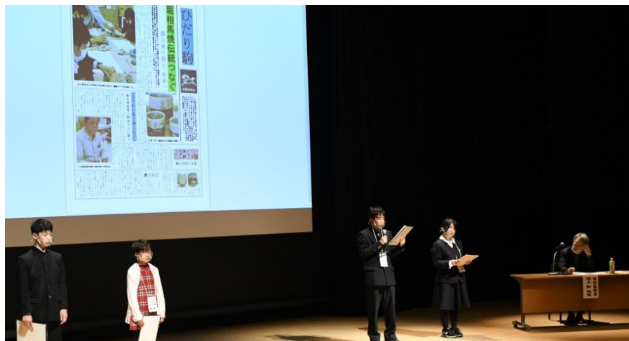
◀ They presented their newspapers in front of an audience, and received comments from Mr. Ikegami (right).

They are trying to report the current situation of Fukushima and the revitalization efforts. During the three days of the Journalism School program which was held in the Soso District, the children learned the status of their hometown and people's thoughts firsthand. By interacting with the journalist Mr. Akira Ikegami, they had a better understanding of how to get the message across in newspapers.