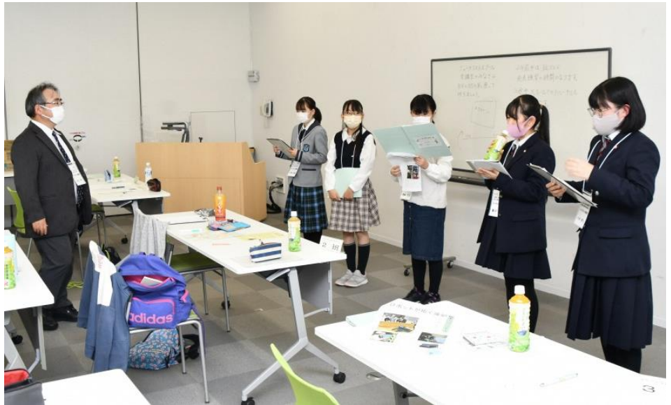
▲“You should speak in a convincing way.” “Speak slowly.” Rehearsals carefully took place before presenting the newspapers.

They are trying to report the current situation of Fukushima and the revitalization efforts. During the three days of the Journalism School program which was held in the Soso District, the children learned the status of their hometown and people's thoughts firsthand. By interacting with the journalist Mr. Akira Ikegami, they had a better understanding of how to get the message across in newspapers.